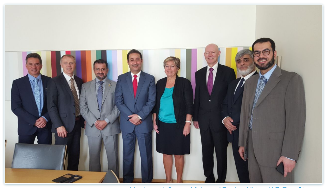
Meeting with Deputy Minister of Foreign Affairs , H.E. Tone Skogen