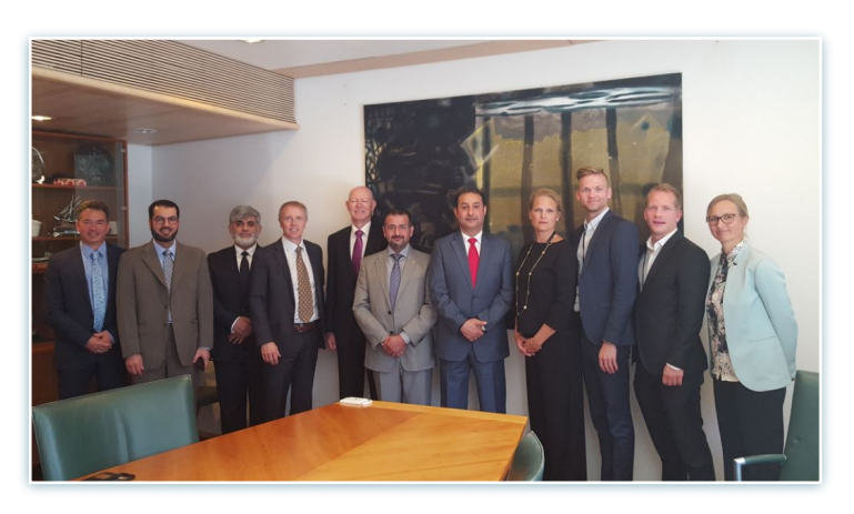
Meeting with Deputy Minister of Oil & Energy H.E. Ingvil S. Tybring-Gjedde

with Cornea Services - representing the Norwegian side - had high-level meetings with both the Norwegian Deputy-minister of Foreign Affairs and the Deputy-minister of Oil & Energy, where strong official support was given. During the meetings the ways to actively boost the cooperation under the Memo of Understanding (MoU) were discussed.